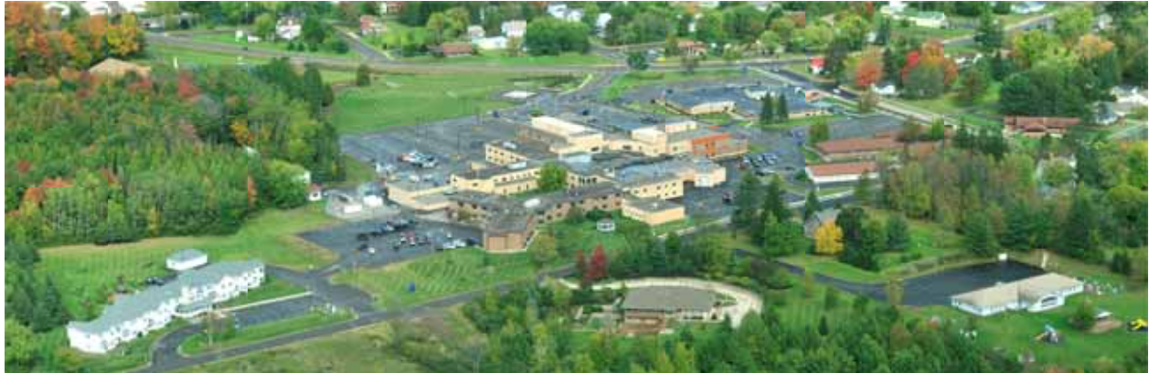
Memorial Health Center Campus, Medford

We take seriously our role as a healthcare provider and steward, promoting health, wellness, and giving back to the community we serve. We, as an organization, and our employees are tremendously active within the communities we serve—volunteering, participating in civic and social organizations, youth sports and academic events, in addition to county services and chamber events.