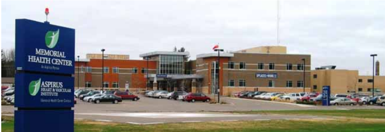
Memorial Health Center, Medford